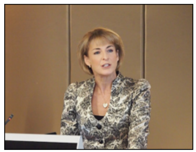
Minister for Women, Senator the Hon. Michaelia Cash

This section provides the transcript of the key address to the National Forum, from the Minister for Women, Hon Michaelia Cash, outlining the Australian Government's priorities and their relationship to women and girls with disability.