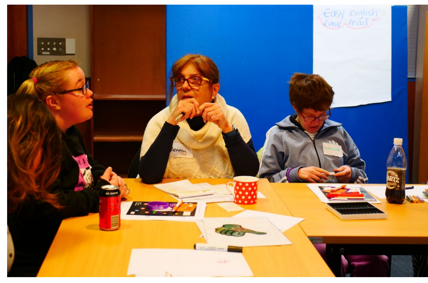
Participants in discussion at the Hobart Workshop

Women with disability are often seen as inadequate mothers because of their disability. Include a mother's story.