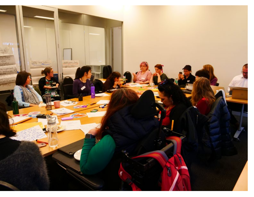
Participants at the Melbourne workshop

Like many 'helpers', the team flew in and out. It is recognised that for future projects there should be more effort made to make time to just be with people and get to know their lives and situation on their terms.