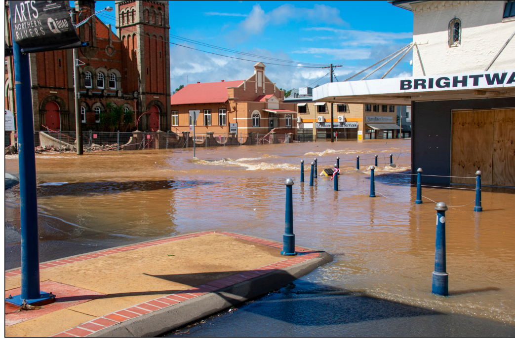
Lismore central business district in March 2022

The barriers to accessing supports in the already difficult recovery journey continue.