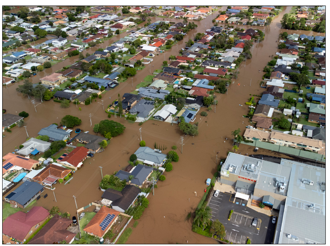
Three days after the February flood in Ballina residents were still waiting for the water to recede.

Climate change means there will be more frequent and severe disasters. The Northern Rivers will flood again. The right to safety and well-being in emergencies is now built into Australia's Disability Strategy 2021-31. It includes, for the first time, targeted action on disability inclusive emergency planning. This must include safe and accessible housing. Improving housing outcomes for people with disability affected by flooding requires the removal of pre-existing barriers that increase inequitable access to safe living situations. This should happen during pre-planning, and we have direction with the new disability strategy.