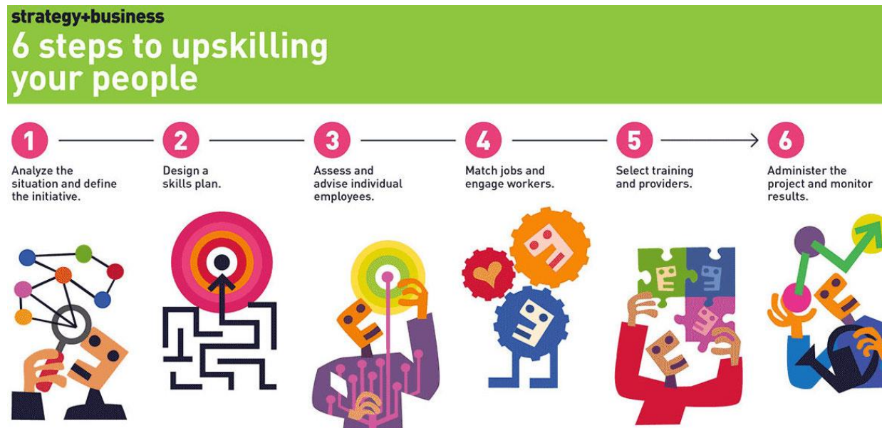
(PIC 2- PWC approach to upskilling staff)

Enter comments here: As a small organisation completely reliant on project-based government funding WWDA has not had the resourcing previously to invest in staff and Board leadership training. Through this new Project however, we are working to research and explore leadership upskilling opportunities for our staff and Board. A considered, researched and customised plan that aligns upskilling and training to company goals is crucial for success. The following approach, developed by the consulting firm PWC, as demonstrated in the infographic below, will be used by WWDA to guide the development of our training and development plan.